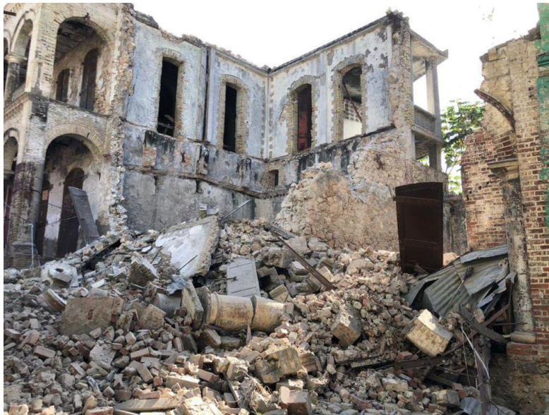
Building damaged by the earthquake in Haiti, August 2021.

On the morning of Saturday, August 14, Haiti was struck by a severe earthquake. The extent of the damage is still unclear. Haitians and the international community are working hard to rescue people trapped under the rubble. But the number of deaths has risen above 2000. Many homes and community buildings have been destroyed. Hospitals have also been damaged, and acutely injured and traumatized people are struggling to find help. And what's more, Tropical Storm Grace hit Haiti on August 16, making an already bad situation worse.