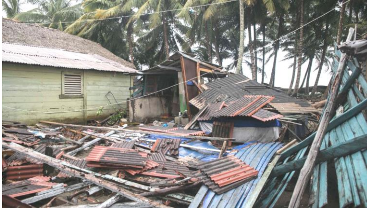
Photo: home flattened by Hurricane Irma in the Dominican Republic.

The United Church of Canada is accepting donations to help Mission & Service partners provide relief to those affected by Hurricane Irma.